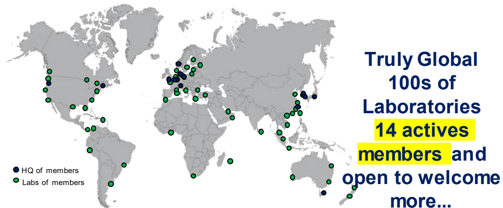
Figure 1: Map of member laboratories